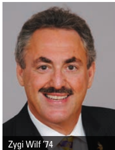
Zygi Wilf '74